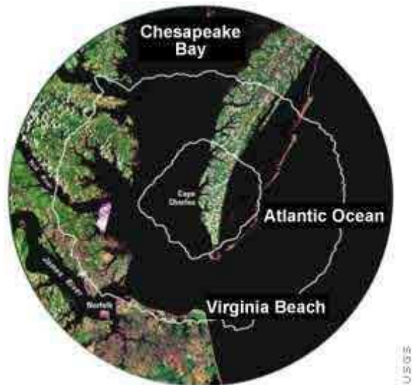
Figure 1. Asteroid impact crater beneath the Chesapeake Bay—the white lines represent inner and outer crater boundaries resulting from an asteroid impact 35 million years ago.

The exact sizes of the asteroids, and the blast effects they create when impacting the earth are uncertain and vary depending on the composition and density of the asteroid and the closing velocity at impact. In rough terms, the effects and frequencies of these larger impacts can be summarized as follows: