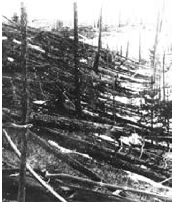
Figure 2. Trees of the Tunguska, Siberia forest flattened by the air burst of an asteroid estimated to be 30-50 meters in size.

penetrate deeper into the atmosphere causing significant damage on the ground, as in the case of the 1908 Tunguska event shown in Figure 2. In both cases, the blast effects from these detonating asteroids would be indistinguishable from a nuclear detonation unless one uses the right remote sensing technology.